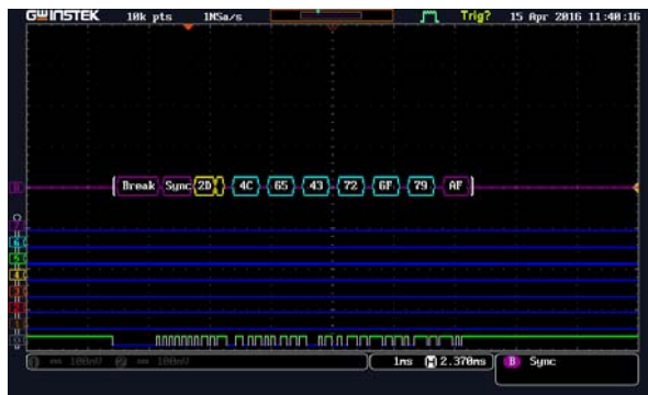
LIN Bus Trigger and Decoding Display

The LIN Bus test solution, with trigger and decoding functions developed by GW Instek, is a standard application equipped for MSO-2000E digital or analog channel and on MDO-2000E analog channel. When engineers are conducting LIN Bus circuit development and debugging, MSO-2000E and MDO-2000E oscilloscopes can trigger packages from different LIN Bus signals for users to clearly observe every package in transmission process and to check if there are any errors in the analog signal which represents each package so as to increase the efficiency of mixed signal measurement and debugging. In addition, MSO-2000E and MDO-2000E oscilloscopes can conduct LIN Bus decoding function to assist engineers to expedite the data reading timeframe. LIN Bus trigger and decoding diagram is as follows: