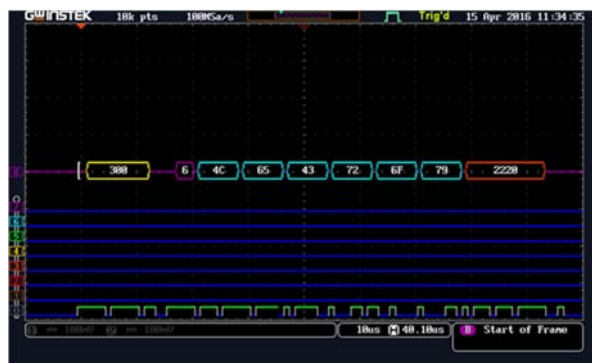
CAN Bus Trigger and Decoding Display

The CAN Bus test solution, with trigger and decoding functions developed by GW Instek, is a standard application equipped for MSO-2000E logic analyzer or analog channel and MDO-2000E analog channel. When engineers are conducting CAN Bus circuit development and debugging, MSO-2000E or MDO-2000E oscilloscopes can trigger packages from different CAN Bus signals for users to clearly observe every package in transmission process and to check if there are any errors in the analog signal which represent each package so as to increase the efficiency of mixed signal measurement and debugging. In addition, MSO-2000E or MDO-2000E oscilloscopes can conduct CAN Bus decoding function to assist engineers to expedite the data reading timeframe. CAN Bus trigger and decoding diagram is as follows: